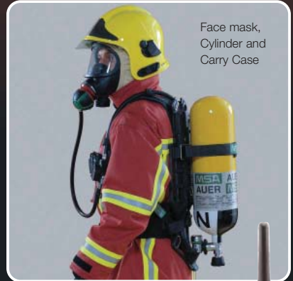
Face mask, Cylinder and Carry Case