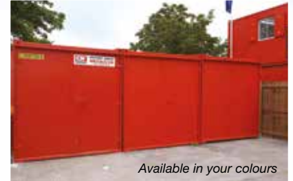
Available in your colours