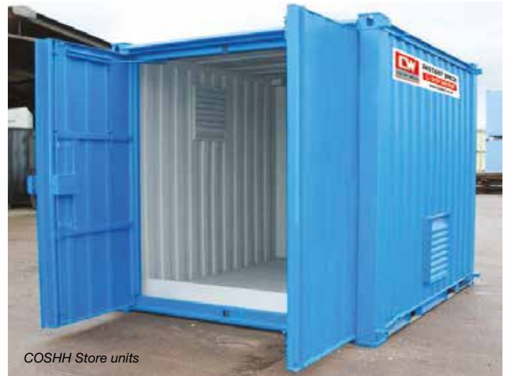
COSHH Store units