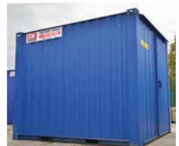
Secure and safe