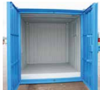
Bunded and vented